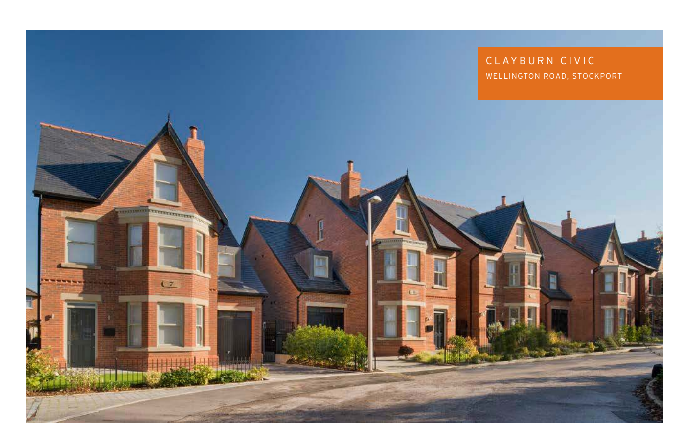
WOLDS MINSTER BLEND