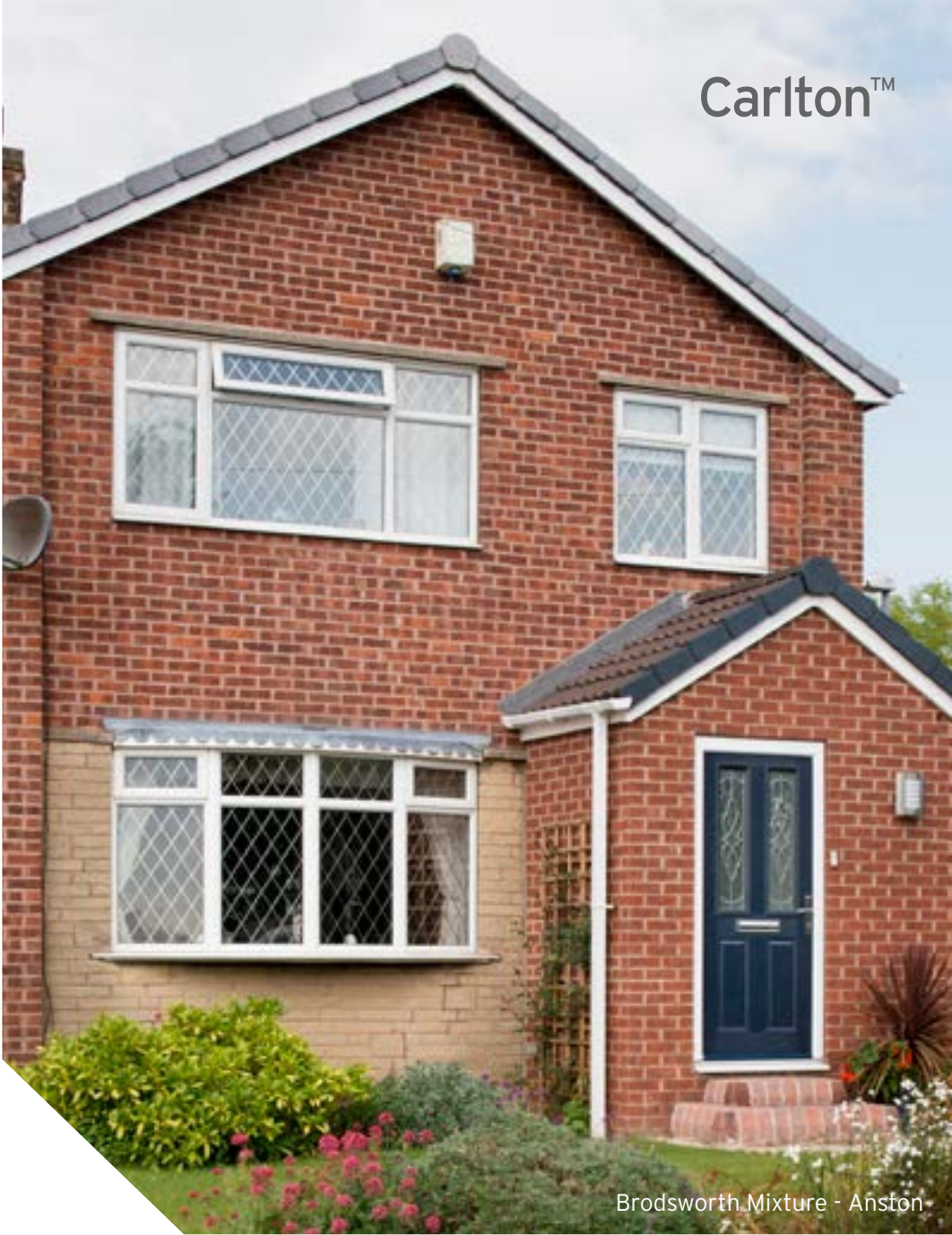
Brodsworth Mixture - Anston